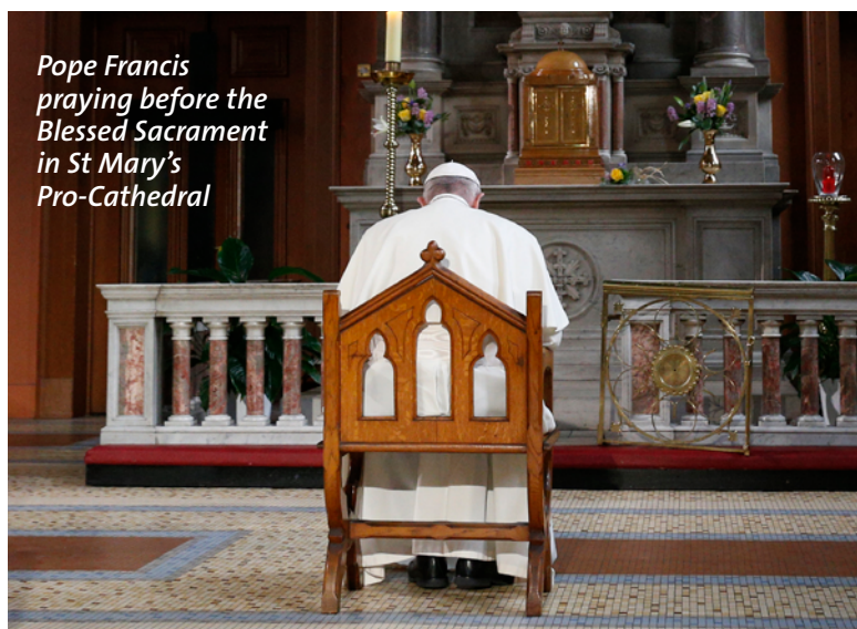
Pope Francis praying before the Blessed Sacrament in St Mary's Pro-Cathedral

The group bonded quickly. Seven of the eight were happy to be identified, but the eighth person asked not to be, a wish that was honoured by the others. They also agreed to meet with the Pope as a group, which made for a much better use of the available time. Pope Francis arrived at the Nunciature at about 5.10 and the meeting commenced within five minutes. There was another meeting scheduled to take place after the meeting with the survivors, after which Pope Francis was due at the Festival of the Families in Croke Park. There was not a lot of time. Pope Francis went into