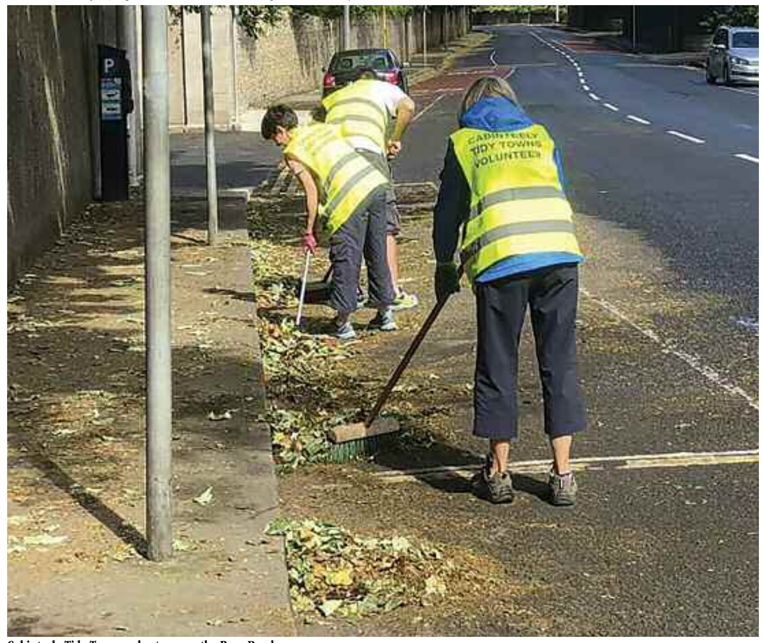
Cabinteely Tidy Towns volunteers on the Bray Road.