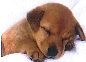
It's Time For A Break